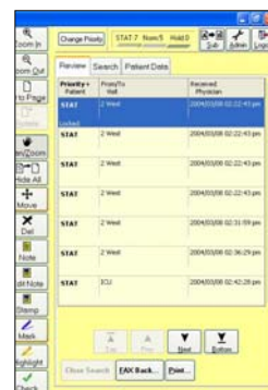
Search for and retrieve past orders at the touch of a button