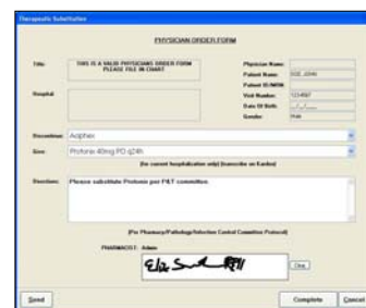
Therapeutic substitutions made easy, plus pharmacist intervention activity is easily documented